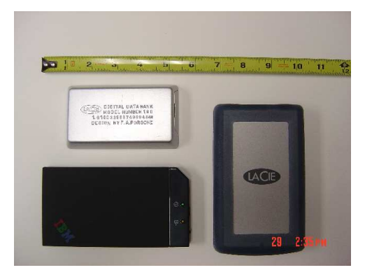
Figure 2: A sample of USB 2.0 portable disks used as SoulPads. Clockwise from upper left: LaCie 40GB DataBank, LaCie 60GB PocketDrive, and IBM 40GB Portable Hard Drive.

The user can suspend his session, then shut down the VMM layer and the Host OS, and walk away with his SoulPad . The user can later attach the SoulPad to a different EnviroPC , start the Host OS and the VMM layer, then load the suspended session state, resume it, and continue his session. If the user's tasks do not require network access, the PC may be completely disconnected from the network.